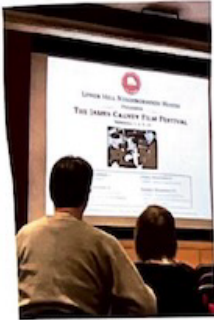
FILM FESTIVAL