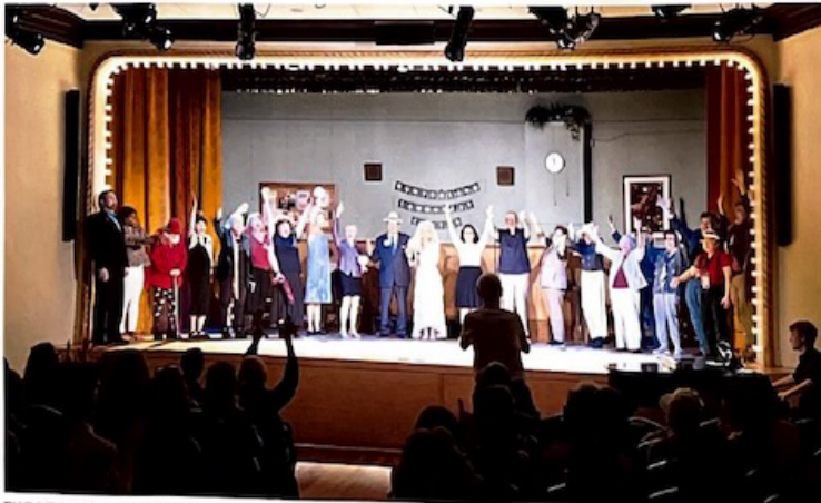
THEATRE PRODUCTION