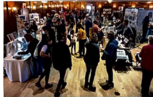
COMMUNITY EVENT / ART SHOW