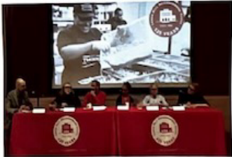
PANEL DISCUSSION