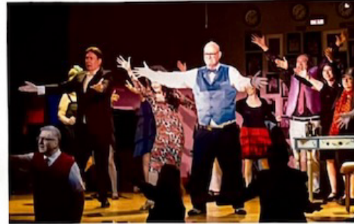
THEATRE PRODUCTION