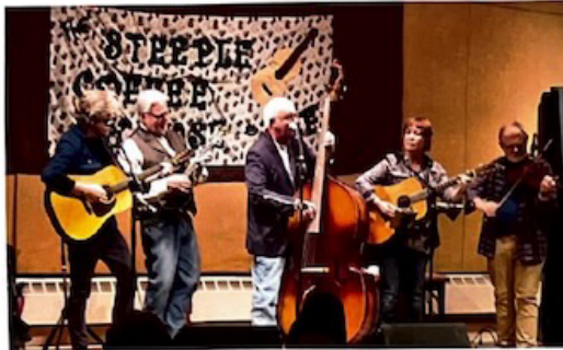
COFFEE HOUSE