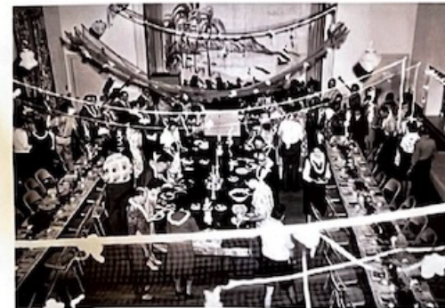
LUAU SOCIAL GATHERING