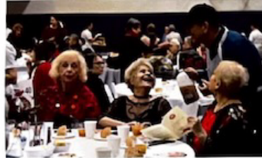
DINNER & DANCE